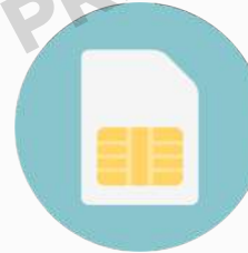
SIM Card Registration