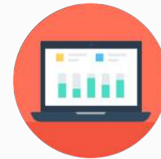
Amendment of Cybercrime Law

PROPERTY OF THE NATIONAL PRIVACY COMMISSION