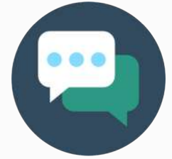
Privacy of Communications