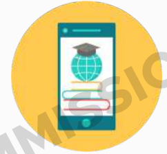
Mobile # Portability